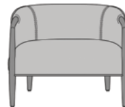
MTDB11 35W 27D 31H 25AH