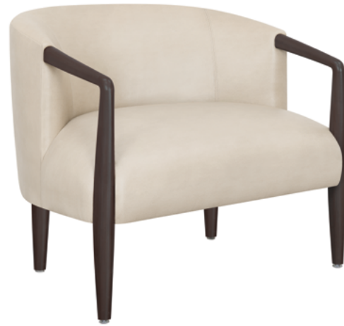
Model: MTDB10 35W 27D 31H 30SW 20SD 19SH 25AH

Kwalu's Montedoro Bariatric chair is plush, angular, strong and inviting. The angled arms form the cylinder front legs which frame the sumptuous seat cushion. Optional piping is available along the back of the chair and on the seat base. The striking Montedoro Bariatric is rated to 525lbs weight capacity and is easily integrated into any common area setting.